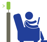
AIRLINE LOUNGE ACCESS